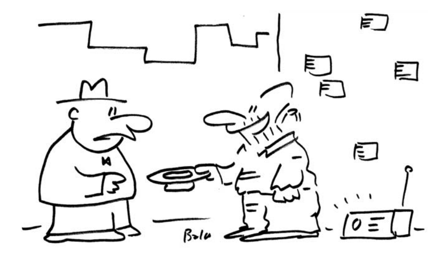
"You're listening to the NPR pledge drive?"

And maybe the economy needed to get sick for us to learn that. Today people are using debit cards more and credit cards less. They've figured out that airline miles and rewards points aren't really free if they come with 18.6% interest rates. Learning some economic truths has required some belt tightening, but that's a good thing in times like these. We've learned, as Gekko says, that "money is a jealous lover. If you don't watch her carefully, in the morning she'll be gone," and that "speculation is a bankrupt business model." As private citizens we are becoming more frugal and setting our own houses in order. Many businesses are building up their cash reserves instead of borrowing money, so they will have more to spend on future investments. In this economic climate, it's in their best interest to do so. That's called capitalism. And it works. "Greed" is good, but self interest is better.