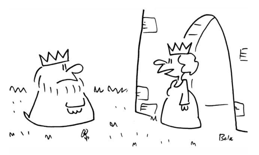
"Oh, I almost forgot - commandeer some bread and milk on your way home."

Besides lowering prices, free trade provides greater product choice, greater product availability (e.g., fresh fruit in the middle of winter), and products of better quality. Griswold refutes the notions that our increased global trade is almost entirely with China (which accounts for only 15% of American imports), and that "big box" retailers